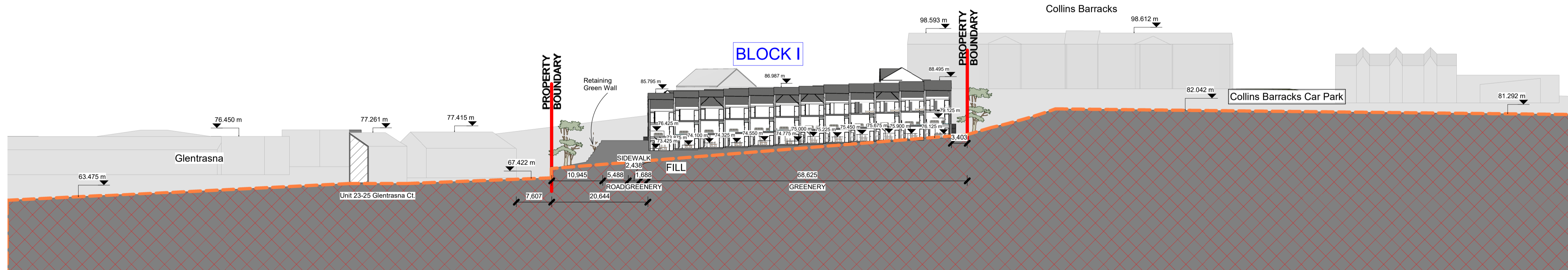
Section F-F 1 : 500