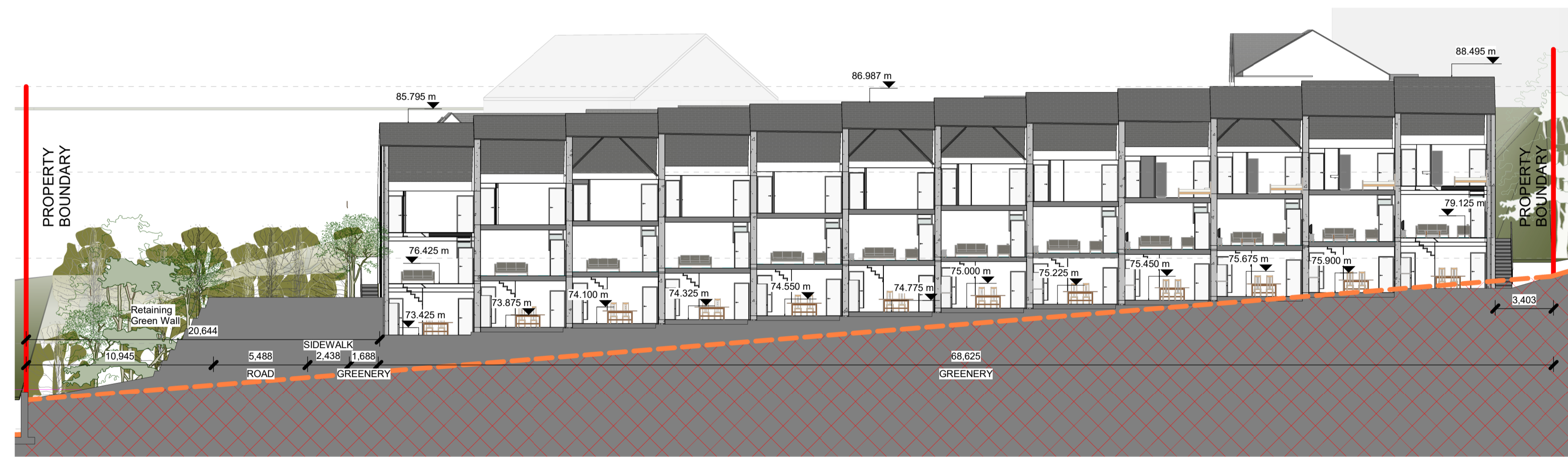
Section F-F - Block I - Long Section 1 : 200