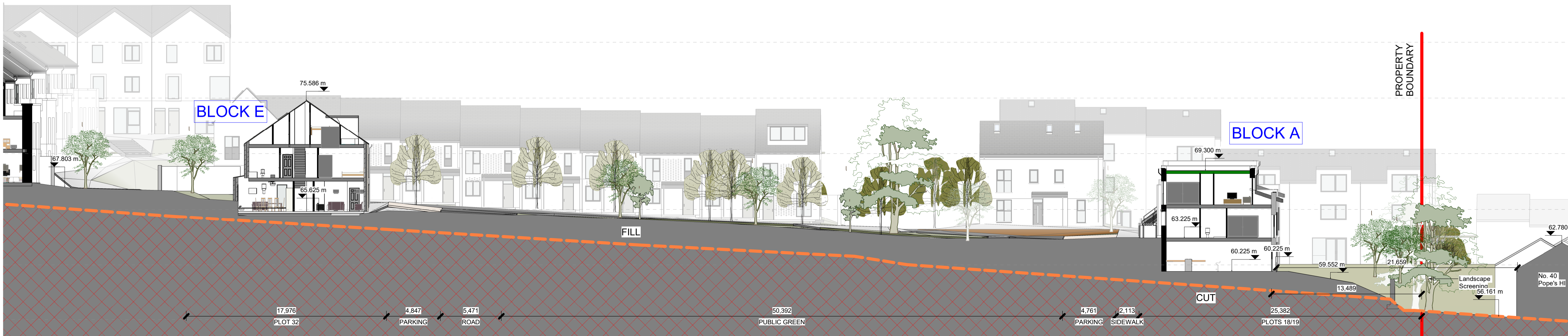
Section D-D - Block A & E - Cross Section 1 : 200

Notes: - Do not scale from this drawing. Use figured dimensions in all cases. - Verify dimensions on site and report any discrepancies to the Architect immediately. - This drawing is to be read in conjunction with the Architect's Specification. - © This drawing is copyright and may only be reproduced with the Architect's permission.