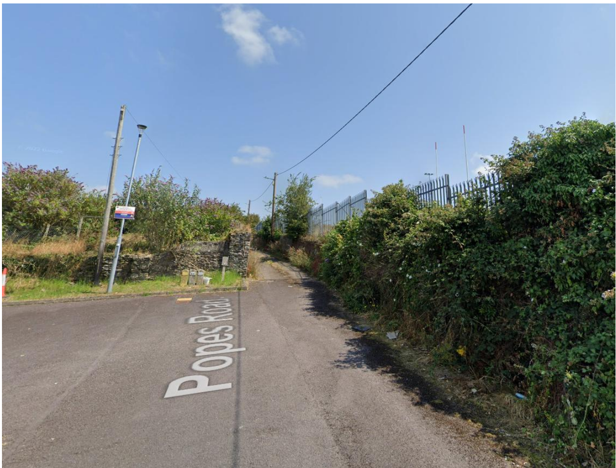
Figure 3-1: Proposed Site Access Point along Popes Road (Eastbound)

The Main Contractor will be responsible for site access/works activity and depending on construction sequencing must ensure the continued safe operation the existing housing estate roads in the vicinity. It is proposed that construction vehicles will access the site from Popes Road via existing access points. Refer to Figure 3-1 for a Google Street view of the proposed Site Access at the end of Popes Road.