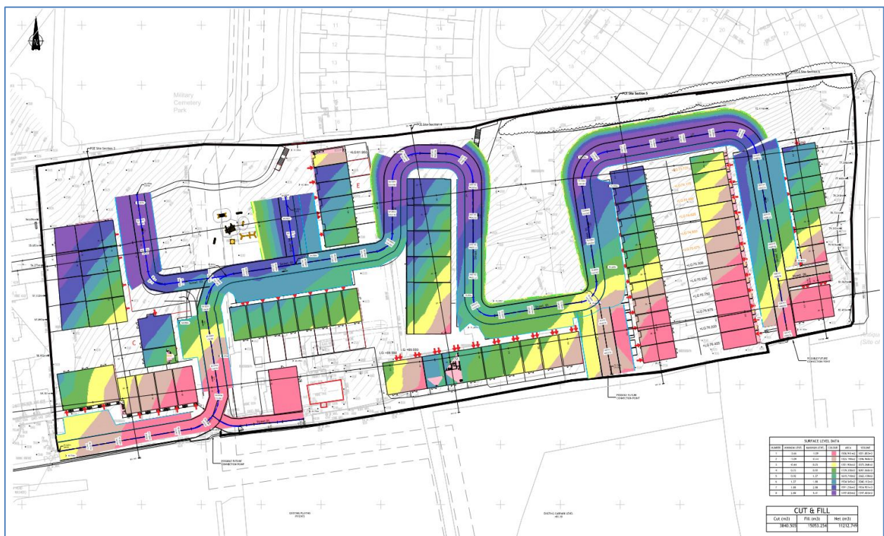
Figure 8-1: Cut & Fill Analysis

The proposed layout is designed to provide for typical maximum road/footpath longitudinal gradients of 1:20 (5%) which will involve re-grading of ground levels across the site. Site investigations have been carried out on site which show that the existing ground conditions typically comprise original material - topsoil on firm sandy gravelly Clay on Gravel soils. PUNCH completed a cut/fill analysis to determine the excavation/importation volumes and to review suitable finished floor levels and road levels for the site with the Design Team. Refer to Figure 8-1 which is colour coded for cut and fill. The southern portion of the site with brown/pink colouring is in cut with the yellow and green areas in the middle portion of the site being neutral. The blue and purple areas are in fill with the heaviest fill areas in purple mostly comprising road and footpath areas with the exception of the northern end of the western building block where split level units are proposed. Following the initial assessment in balancing the site, the Architect prepared sections through the site which indicates the proposed floor levels and existing ground levels and the sections accompany this planning application.